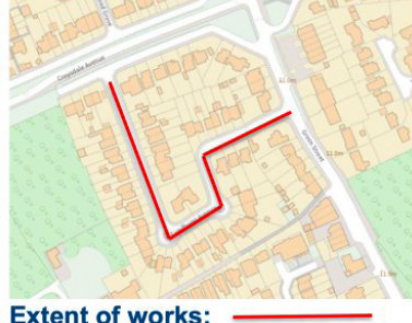
Extent of works: —————

Residents will be pleased to learn that Surrey Highways resurfaced the road and recently completed reconstruction work on the pavements in Lyndhurst Avenue.